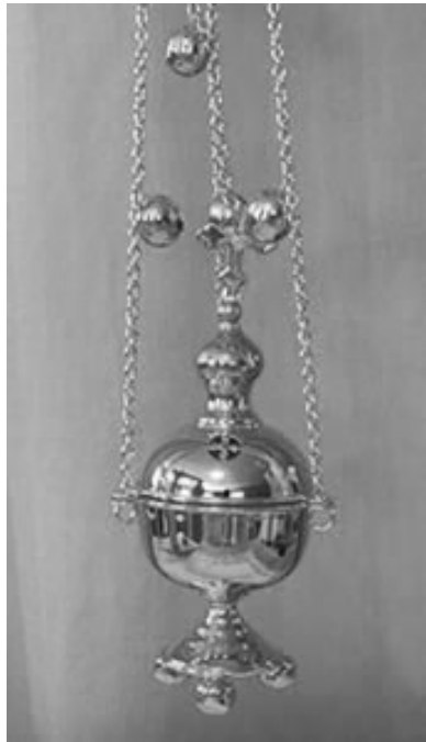
Censers used in the Eastern Catholic and Eastern Orthodox Churches traditionally have twelve or thirteen bells attached to their three supporting chains to represent the Apostles.

Some individuals incorrectly believe that the only role of Sanctus bells is to signal the consecration of the Eucharist. Many who share this view feel the use of the bells is now obsolete or even retrogressive because the Mass can now be celebrated in the vernacular (versus Latin only), and because the celebrant can now face the faithful (versus having his back to the faithful) during the Mass, negating the need for a signal. This position might be plausible if indeed the Sanctus bells' only function was to indicate the confecting of the Eucharist. This however is not the case, given the multiple functions of the Sanctus bells.