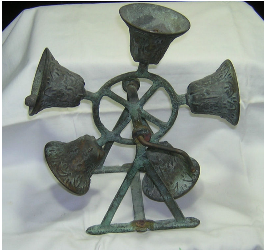
An antique five-bell bronze "gloria wheel" once used during the celebration of the Mass. Such instruments are simple to use and create truly glorious sounds as an offering to God.

Most Catholic Christians (at least the more mature ones) are familiar with Sanctus bells. Many wonder about them. Some long to hear their joyful sounds. Still others erroneously believe their use during the Mass is now either no longer needed or is prohibited altogether by the Church. This short monograph explores the history (both fact and fiction) and current use of Sanctus bells, plus their potential as powerful devotional aids in today's Catholic Church.