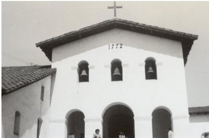
The earliest sanctus bells were typically the largest or smallest outdoor bell of a cathedral or church similar to those of Old Mission San Luis Obispo de Tolosa.