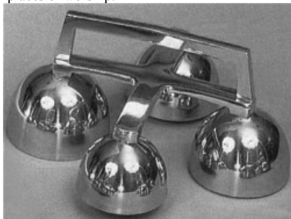
Modern Sanctus bells often have a simple, utilitarian look but can still produce beautiful sounds due to their high quality bronze construction.

The use of Sanctus bells is enjoying a heartening renaissance in the Catholic Church today. As Catholic liturgical history becomes better disseminated and understood, more and more individuals are beginning to view the Sanctus bells as part of the rich sacramental tradition of the Catholic Church much like: holy water, the holy oils, statuary, iconography, clerical vestments, candles, incense, and historic and/or solemn places of worship.