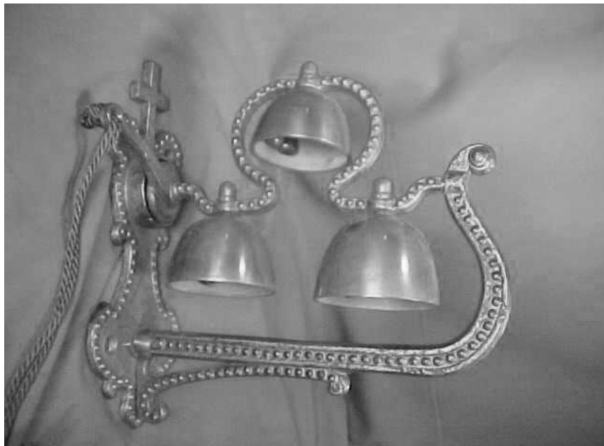
Ornate bronze sanctuary chimes were once commonly mounted near the altar or credence table.